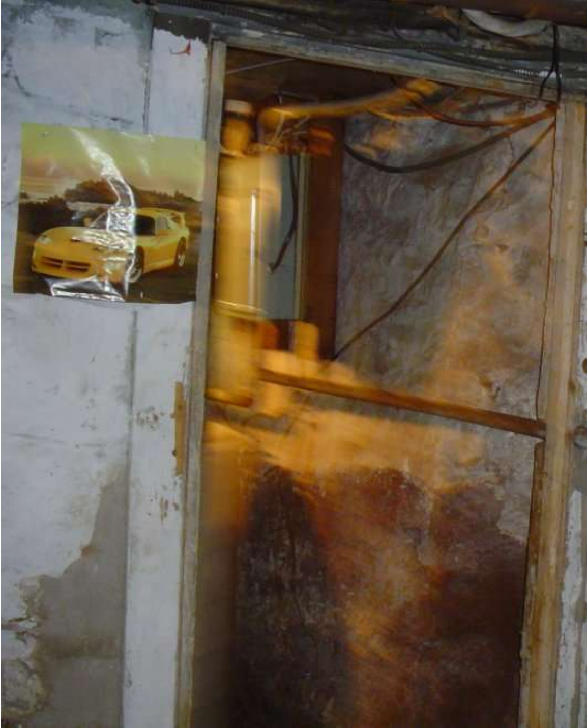
Initial Photo taken in the fall of 2006 during the preliminary investigation